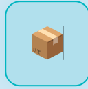
Set-Top Box (STB)